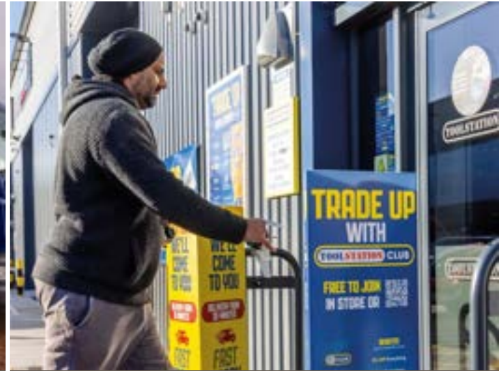
Toolstation growth potential