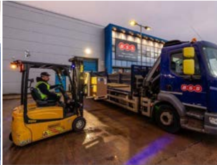
Comprehensive UK network