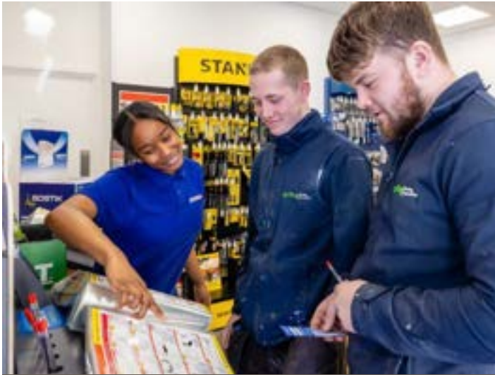
Strong customer and supplier relationships