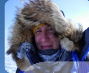
Senior Instructor Felicity Aston

former Warrant officer with the Royal Logistics Corps his vast experience with leading operations and logistical support solutions in remote and hostile countries provides EWR with a very experienced Executive Operations Director. He previously worked as a consultant to the UN providing logistical infrastructure supply routes in remote parts of Afghanistan to assist with the Afghan elections