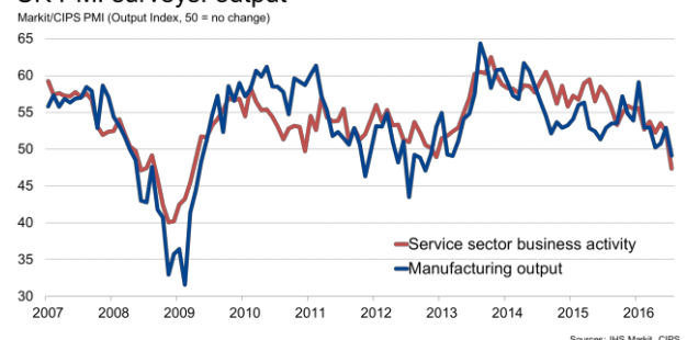
UK PMI surveys: output